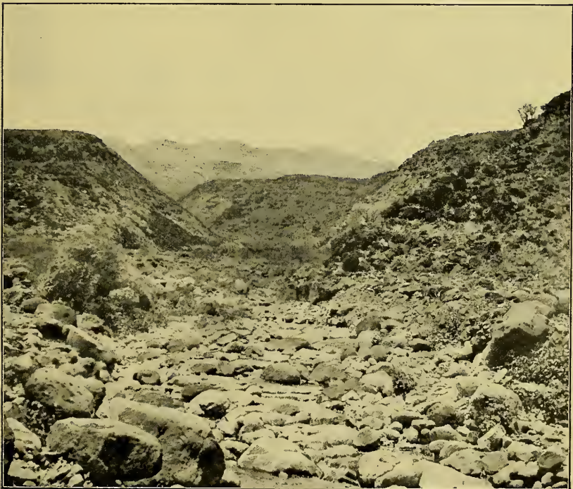
B. MOUTH OF KAWELA GULCH, SOUTH COAST OF MOLOKAI.

Showing seacliff and successive basalt flows sloping down toward the coast.